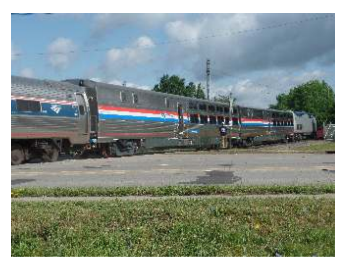
Amtrak fetching diners 'Boston' and 'Baton Rouge' from CAF-USA in Elmira Heights, NY, that are named after state capitals.