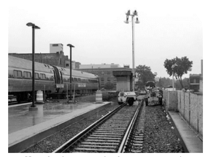
View of station construction from temporary station

The use of GCT required the switching of third rail shoes on the locomotives and the use of Metro-North engineers from Spuyten Duyvil at the north end of the Bronx to GCT. Intercity trains from Upstate NY historically ran into GCT until 1991 when an old freight line on the West Side of Manhattan was rebuilt and opened as the "Empire Connection" to Penn Station. This facilitated in-station connections to Amtrak's other services on the BosWas Northeast Corridor.