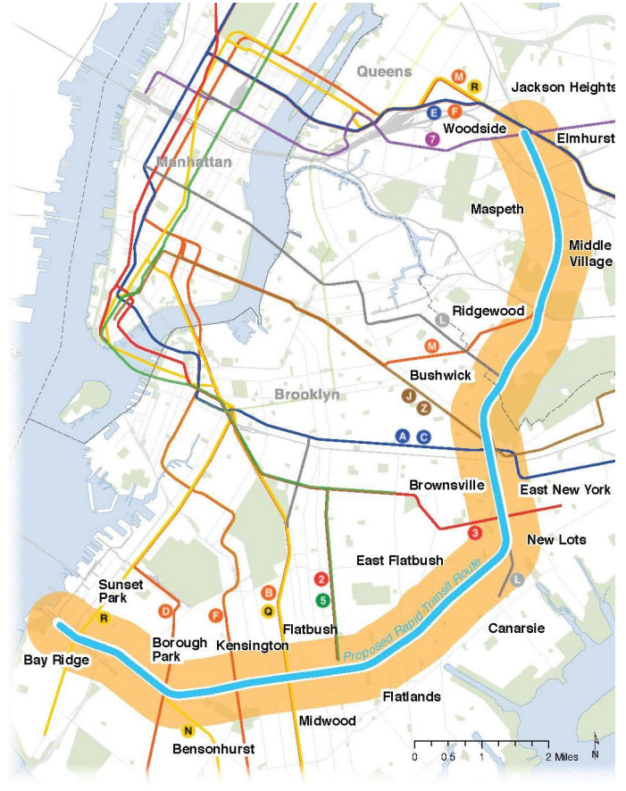
Overview map of the existing freight rail corridor, subway connections, and the primary study area. Note that while most of the IBX corridor runs along the Bay Ridge Branch, a portion includes the Fremont Secondary.

The completion of the 32-mile-long English Channel freight and passenger tunnel seems to suggest a shorter tunnel crossing of New York Harbor is possible. With the passage of a significant multi-year federal infrastructure improvement fund, the Governor's advocacy of two longsought improvements in both passenger and freight transportation seems a possible reality.